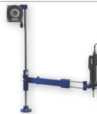
LINAR and LINART Arms