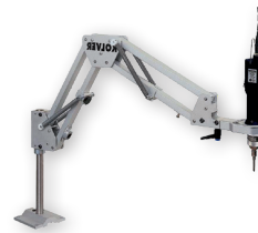
PA2KOL Folding Arm