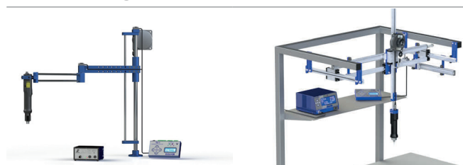
TLS1/LINART Positioning Folding Arm