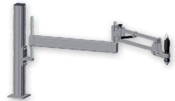
PS7KOL Folding Arm